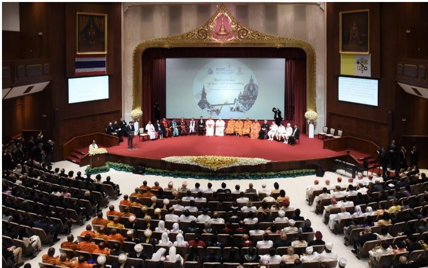
Photo: Pope Francis meets with priests and representatives of different religions at Chulalongkorn University Auditorium

Thailand would not be where it is today if the monarchy did not serve as a pillar of strength and a guiding light, leading by example and wielding incomparable moral authority. The generosity, thoughtfulness and embracing of diversity extended from the sovereign have shaped the nation and countless lives. Following their monarchs, Thais have adopted a mentality of openness and mindfulness of the differences among faiths and religions, and most importantly, a profound respect for those differences. The actions of the monarchy have indeed forged connections, furthered interreligious understanding and demonstrated that, regardless of what faith we hold, we are bound together by goodwill and shared values of kindness and respect.