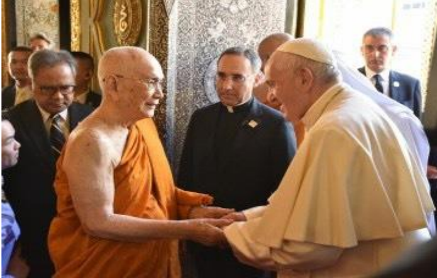
Photo: Pope Francis meets with Somdet Phra Ariyavongsagatayana, Supreme Patriarch of Thailand, at Wat Ratchabophit Sathitmahasimaram