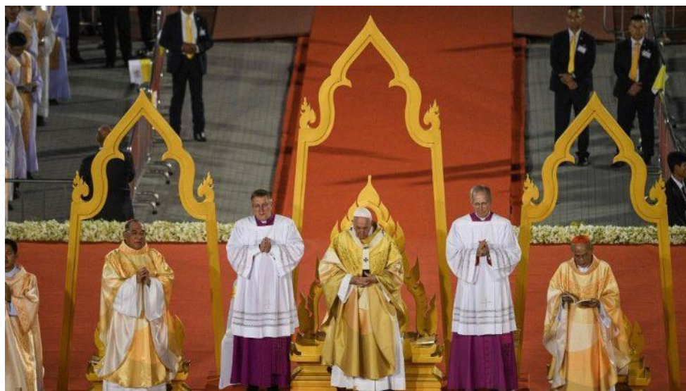
Photo: Pope Francis celebrating his first public mass at the National Stadium in Bangkok in November 2019 (Source: Vatican News website)